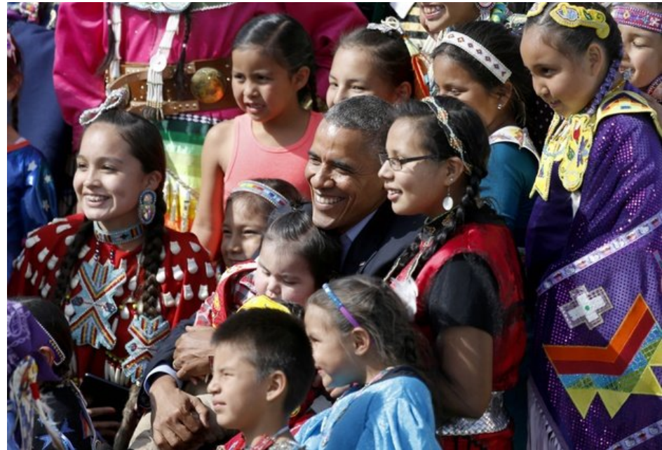
President Barack Obama