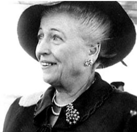
Pearl S. Buck (1892-1973)

'If our American way of life fails the child, it fails us all.'