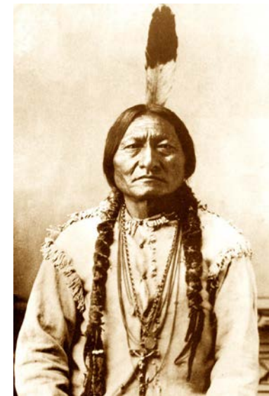
Sitting Bull (1831-1890)

'Let us put our minds together and see what life we can make for our children.'