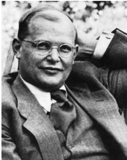
Dietrich Bonhoeffer (1906-1945)

'The ultimate test of a moral society is the kind of world that it leaves to its children.'